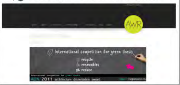
Step 5 click on the image of the competition to which you want to participate