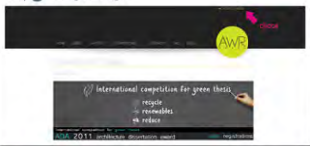
Step 1 site registration begins