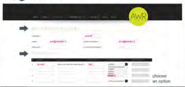
Step 3 compile the required fields of the registration form