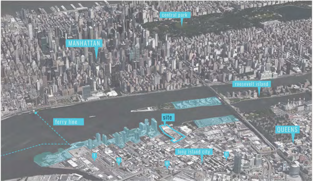
New York City | view looking west