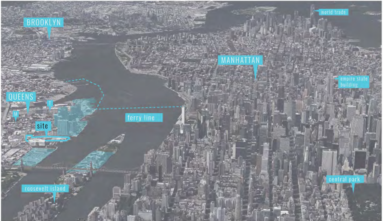
New York City | view looking southwest