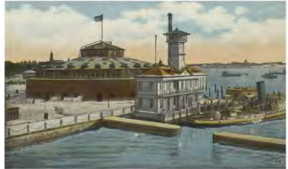
ny aquarium at battery park

The aquarium today has become a key cultural destination for visitors of large cities while simultaneously serving as a public icon to surrounding communities.