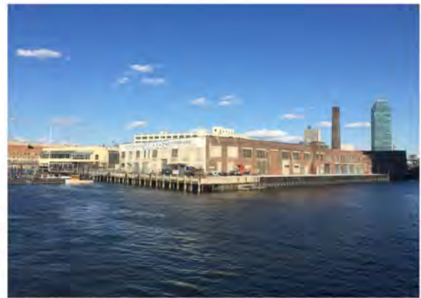
east river & eleventh street basin

The aquarium attempts to continue this discussion by implementing an element of usable space surrounding the building which serves both the public and environment. This public space can be intertwined and inseparable from the proposed program, thus breaking up the singular icon of an aquarium building.