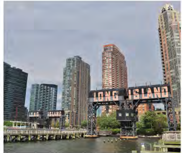
long island gantrys

The site is easily accessible by metro with the Court Square station located within a 10-minute walk. Rail lines from all over New York come into the Hunterspoint Avenue and Long Island City train stations. Both are about a fifteen minute walk away from the site. A ferry line currently runs through the East River and connects Manhattan with Hunters Point just south of the proposed site, about a 15-minute walk away.