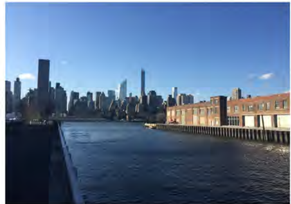
manhattan & eleventh street basin