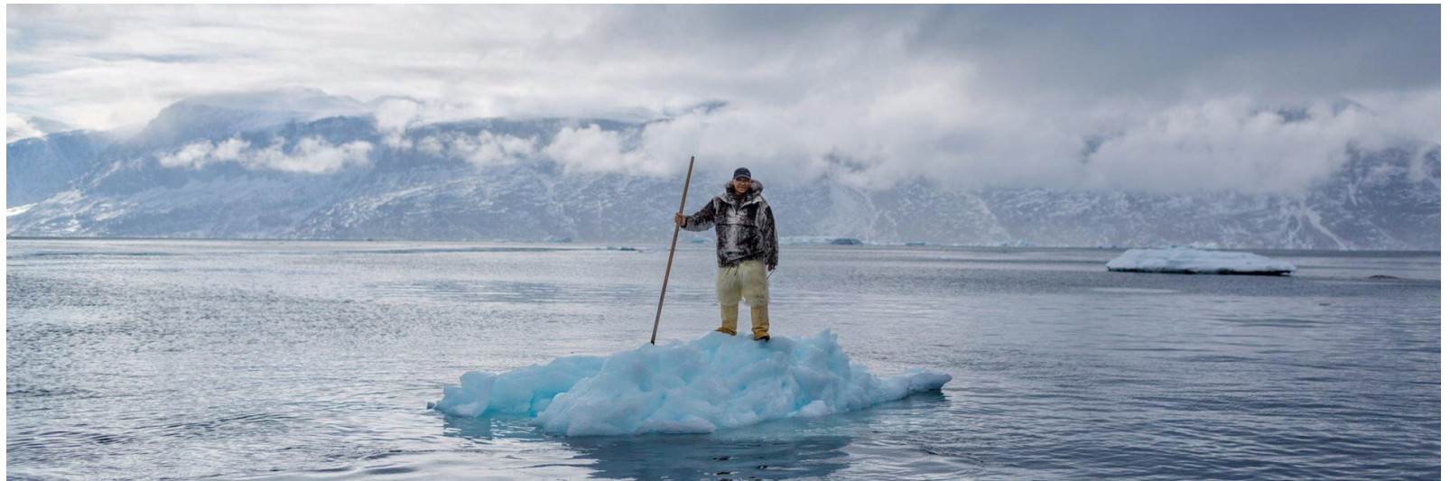
Imagen inferior derecha Ibiza. AAVV

This documentation will be named as described in the "Welcome-Bienvenidos" file.