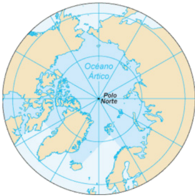
Océano Ártico Polo Norte Latitude: 0° N Length: 0° E

* Being a contest of ideas, participants are free to modify the proposed surfaces. This report should be taken as a reference of the spaces necessary for the project to be functional and as a measure of the total dimensions of the project. Participants can suggest new areas not proposed in this document, as well as eliminate or combine some of those already mentioned.