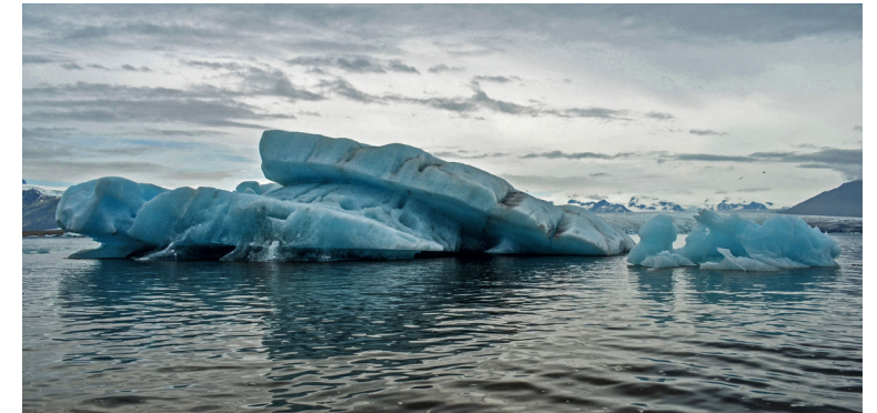
Imagen superior izquierda: Glaciar en Argentina.

And now well, will we react? Can you unite the whole world for a common good? What is needed for this? Is the problem only of misinformation? The problem is one of high complexity and the search for transversal solutions that can not be given from a single discipline.