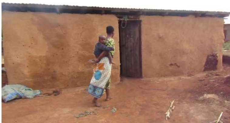
Hut: used as interior kitchen and storage.