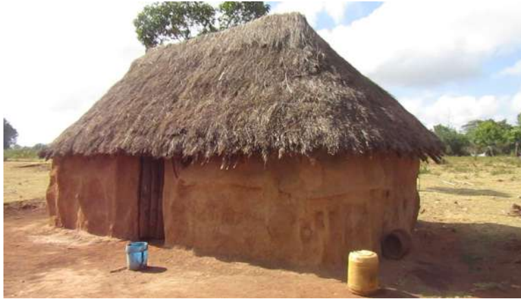
Hut: this is where most of the family sleep, sharing the space with some small animals such as chickens or ducks.