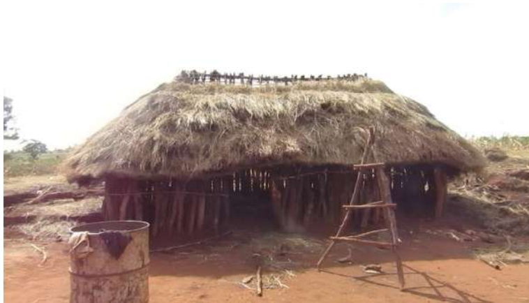
Hut: this one is being rebuilt. Dad is currently sleeping here.