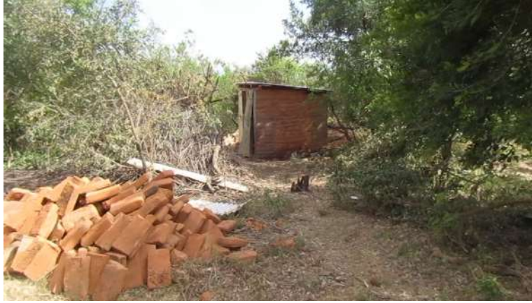
Shower and latrine module