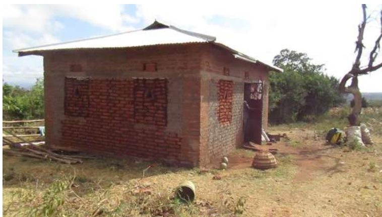
Nico's brick house: still under construction.