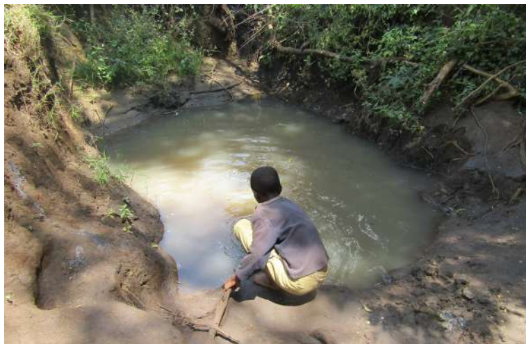
Scoophole where they fetch water

The budget for the house is 20.000€ (50 milion Tanzanian Shilling). A list of price references, along with a site plan, will be sent after registration.